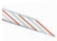
WA13 Aluminium rack up to 2 m. Pc./Pack 1