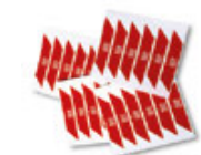
WA10 Red adhesive reflector strips. Pc./Pack 24