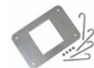
XBA17 Red base with clamps. Pc./Pack 1