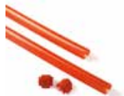
XBA13 Rubber impact protection strip. Length 1 m. Pc./Pack 9