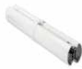
XBA9 Expansion joint. Pc./Pack 1