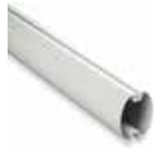
XBA5 White paint-finished aluminium bar 69x92x5150 mm. Pc./Pack 1