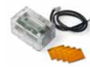
XBA7 Integrable flashing light. Pc./Pack 1