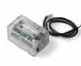
XBA8 Integrable traffic light. Pc./Pack 1