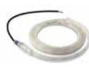
XBA18 Indicator lights for click fixture on upper or lower side of bar. Length 8 m. Pc./Pack 1